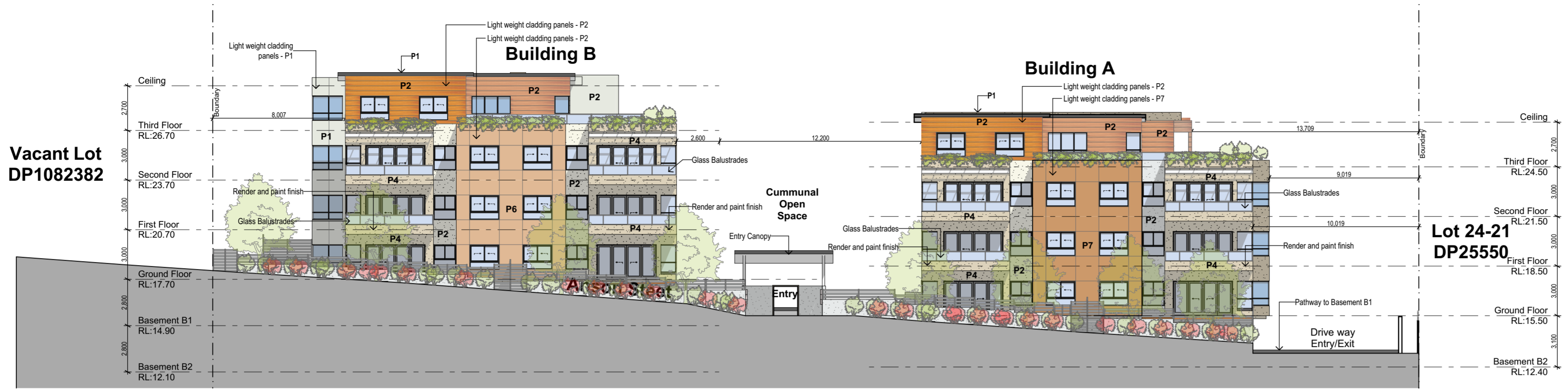
Building A & B - North Elevation Scale 1:200